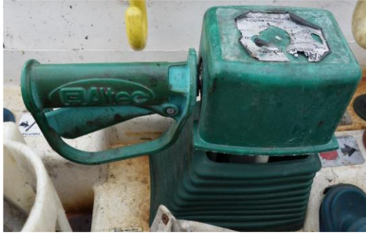
Figure 2. Pistol grip control in aerial bucket that moves in six directions to maneuver the aerial bucket.