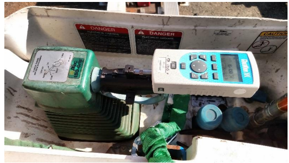
Figure 3. Chatillon™ force gage attached to the pistol grip control to measure forward/rearward force. A 3D printed clamshell (black) was secured to the pistol grip to provide a secure mount for the Chatillon™ gage.

Applied force data from this study represent a baseline of forces from current pistol grip designs from four major manufacturers (Altec, Terex, Telect, and Lift All).