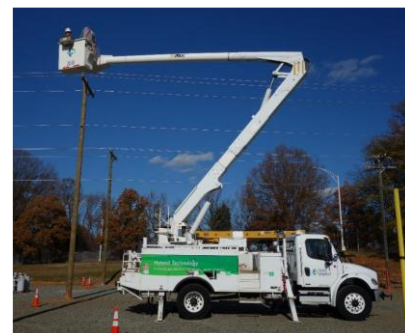
Figure 1. Typical electric utility aerial bucket truck with a 2-segmented boom.

The objective of this study was to measure the applied force to operate the control and the required muscle activity of major forearm muscles to determine if these forces provide biomechanical and physiological evidence for the reports of muscle fatigue from workers.