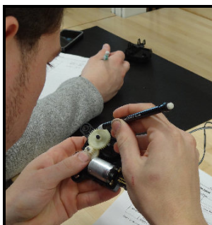
Figure 4: Counting gear teeth in HVAC baffle drive in Experiment 4.