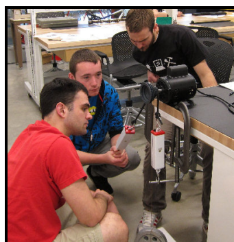
Figure 6: Investigating belt tension in Experiment 5.