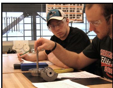
Figure 3: Checking fit of ground rod in Experiment 3.