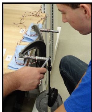
Figure 2: Measuring strain in round stock with stress concentrations in Experiment 2.