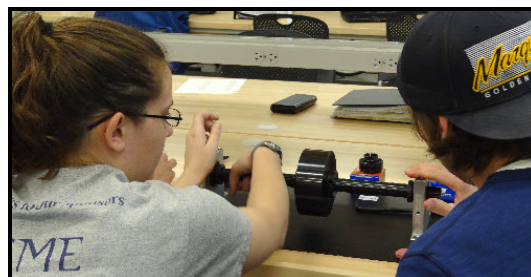
Figure 7: Investigating bearing operation in Experiment 6.