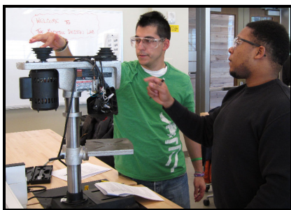
Figure 1: Investigating the operation of a drill-press in Experiment 1.